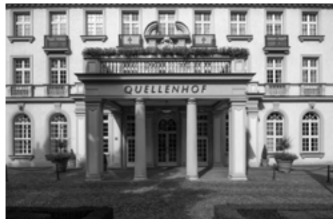
Hotel Pullman Aachen Quellenhof Aachen, Germany